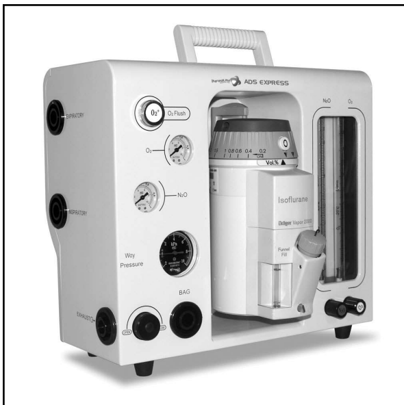
3 Side Ports (Expiratory, Inspiratory & Exhaust)